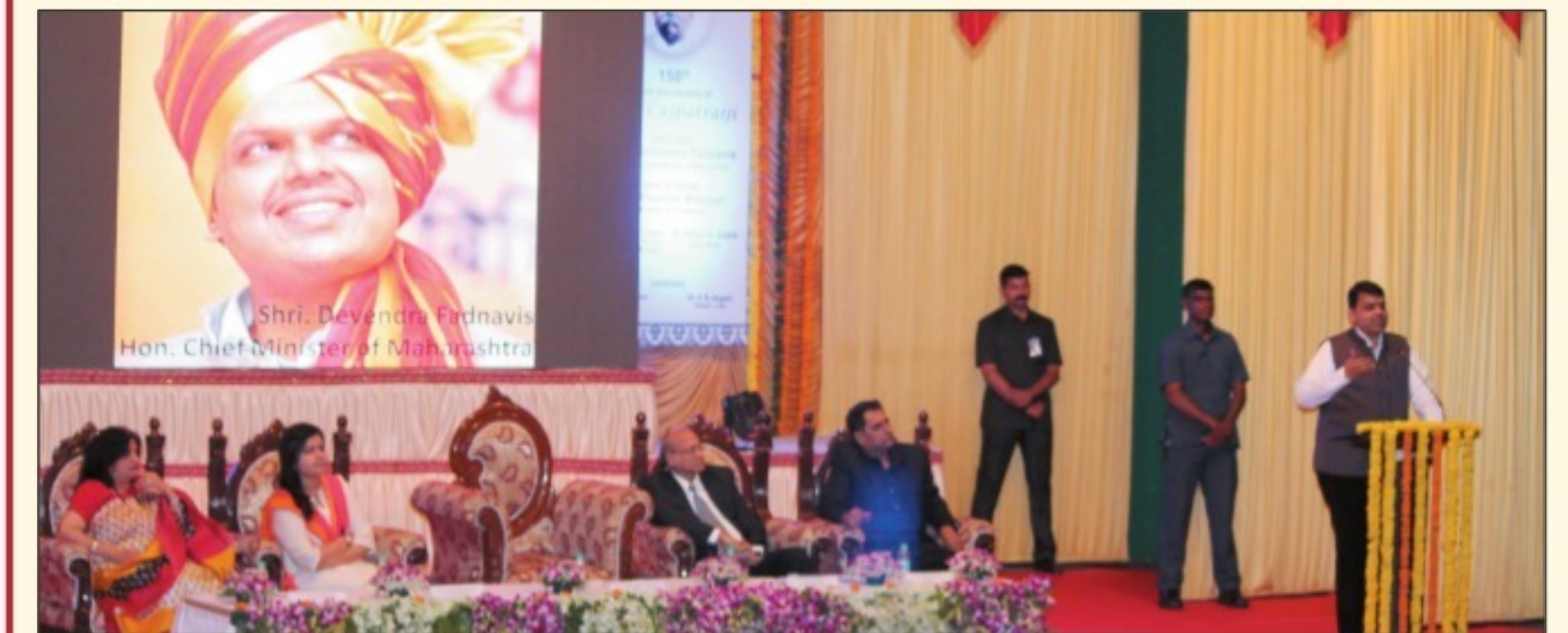
CM Devendra Fadnavis delivers his address

Swami Vivekananda had explained patriotism towards the country in three easy steps – the first being feeling for the fellow countrymen; the second to decide that sitting tight is no option, brining change is necessary; and the third, taking a small step in your sector towards improving the situation. That would be true service to the country.