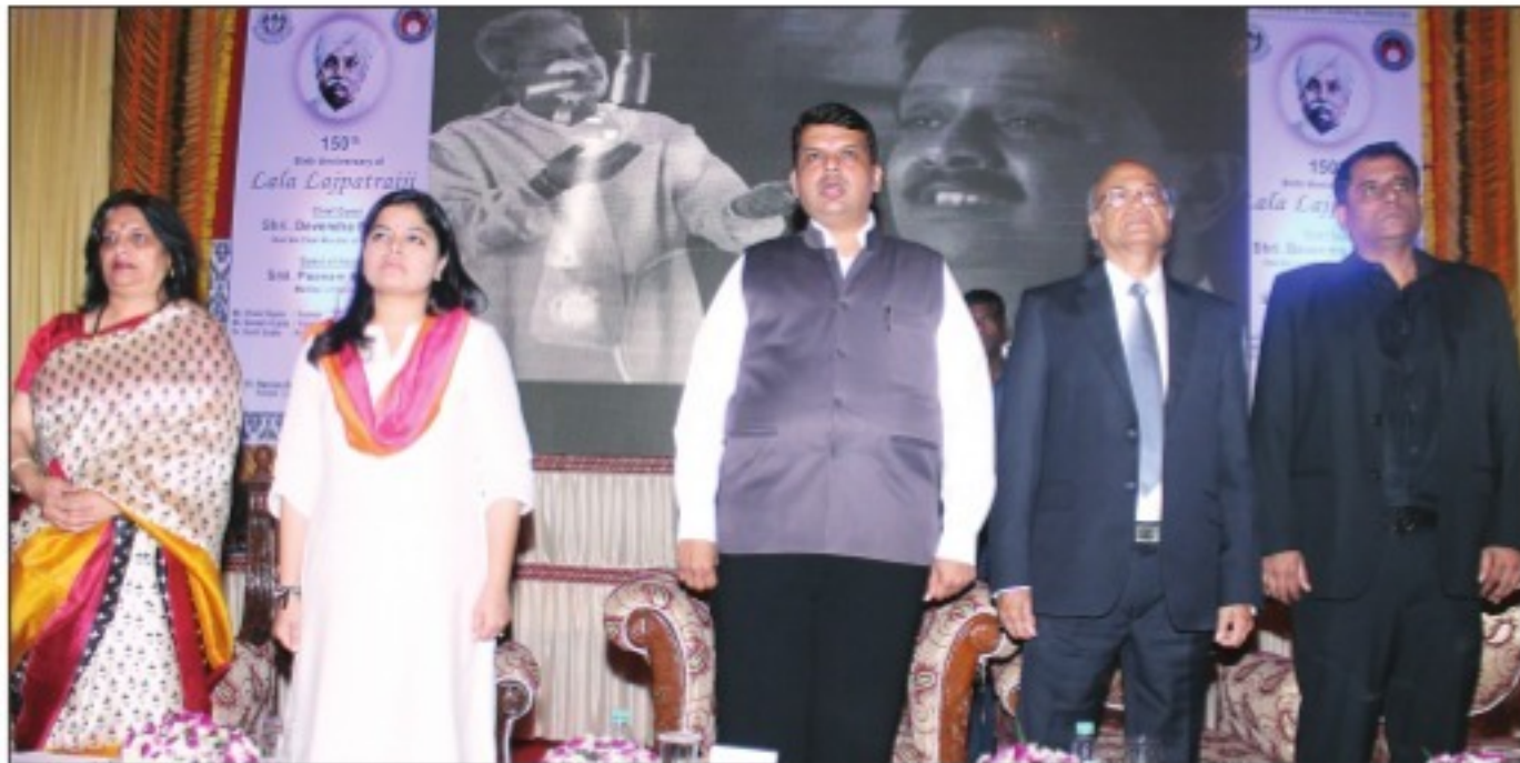
The dignitaries stand for the national anthem