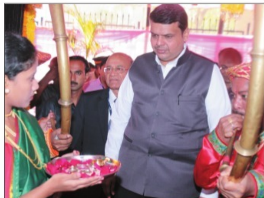
A traditional welcome for CM Devendra Fadnavis