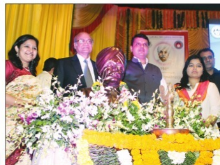
Dignitaries honour the statue of Lala Lajpatrai