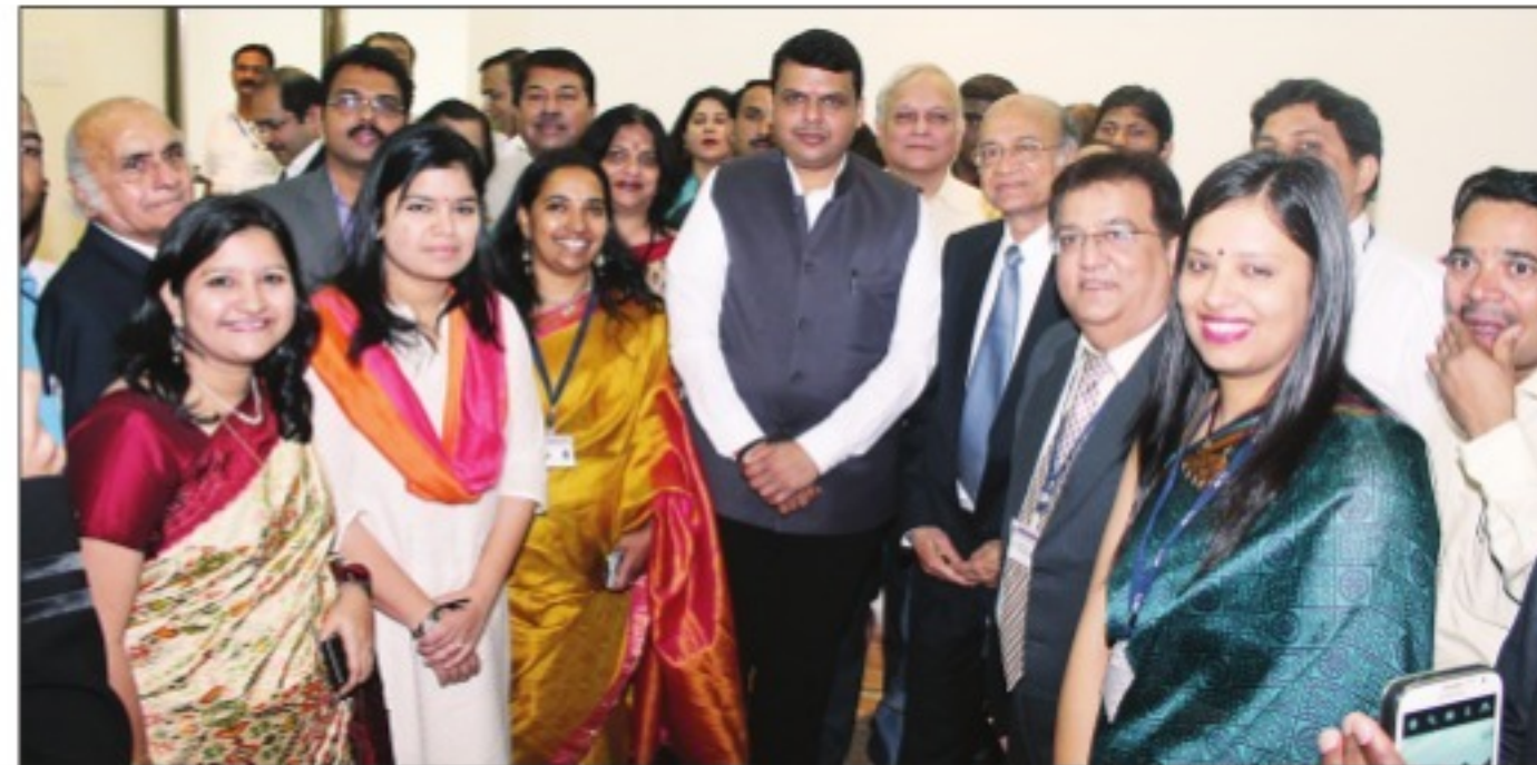
The dignitaries with the college staff