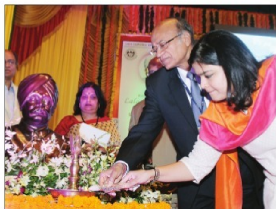
Lighting the inaugural lamp