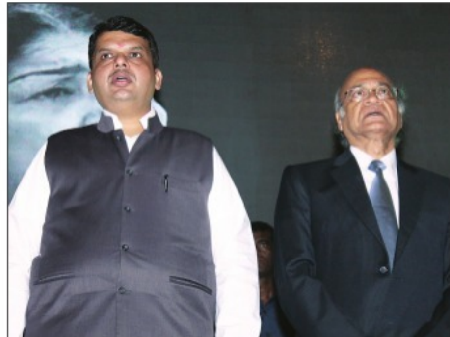
Standing for the national anthem